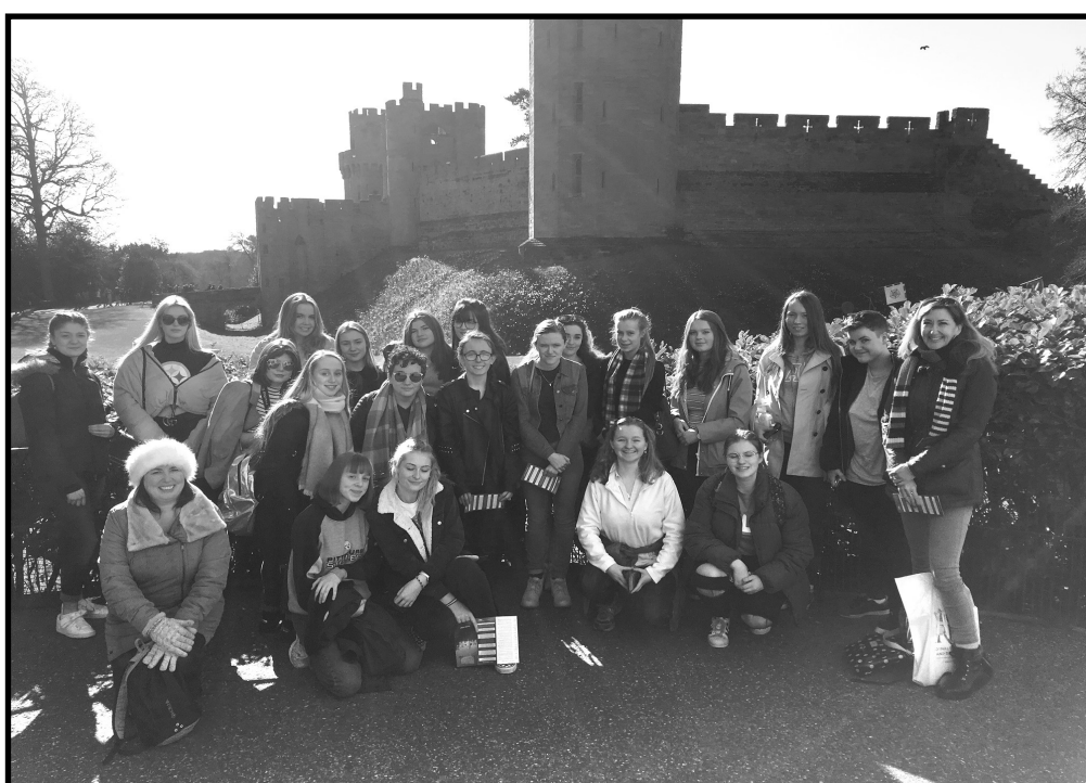
Medieval History Weekend Trip at Warwick Castle