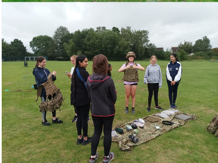
Above right: Year 8s enjoyed Team-building activities with the Army:

"I enjoyed the archery, as it was not something we would normally do. I liked the variation from the normal. I also liked learning about potential jobs in the army. Overall I had an amazing day and it was a wonderful way to end Curriculum Enrichment Week"