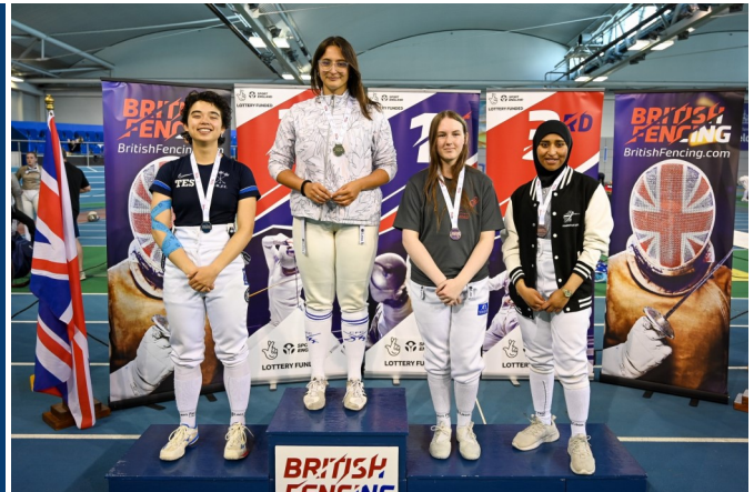
British Fencing Senior Open Championships 3rd and 4th June 2023 (Held at the English Institute of Sport in Sheffield)