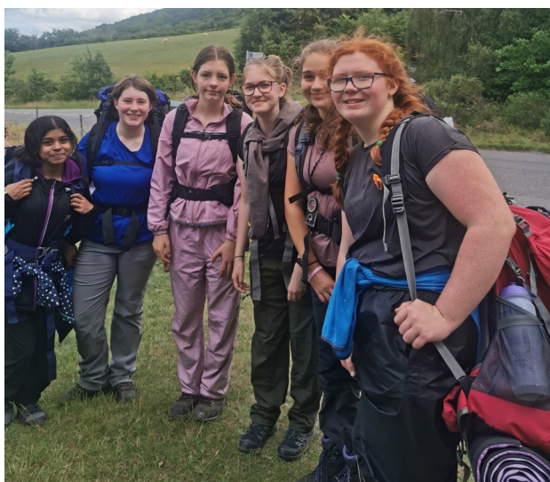
Year 9s enjoyed finding their way across the local countryside (and avoiding bulls in fields!)