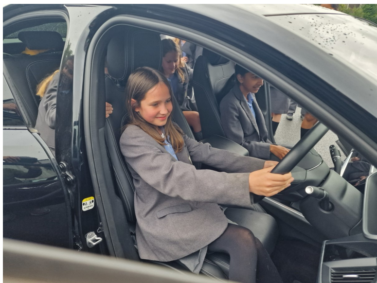
NGHS students get their hands on new executive cars from Jaguar Landover during an exciting STEM day.