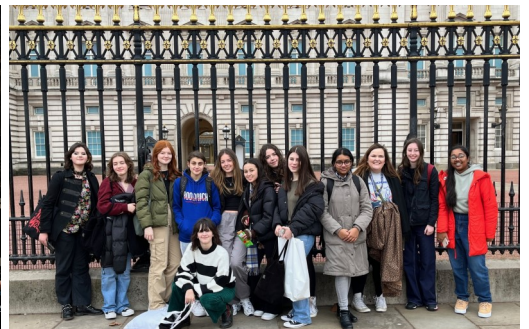
Year 11 enjoyed a walking/tube tour of the sights of London before watching WICKED. They are pictured above at Buckingham Palace. Sadly HM The King was not taking callers!