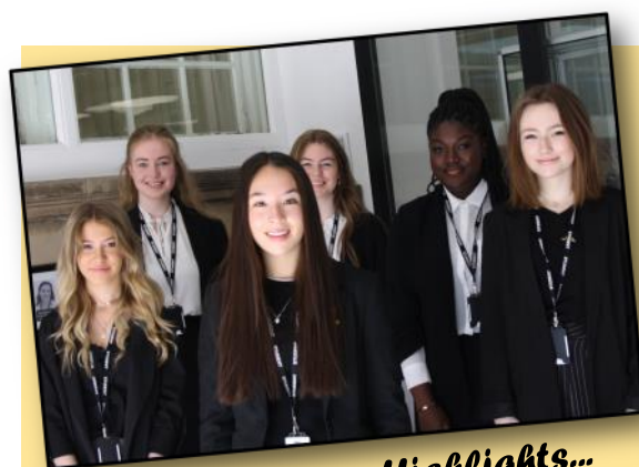
Head Girl Team Highlights...

Only one week left until half term! I hope that everyone is settling in to the Newport community and getting involved in all the incredible activities offered. In 'Crafternoons', there is an exciting opportunity for House Pumpkin Carving next week! A great chance to show off all your creative spooky designs and to get into the Halloween spirit.