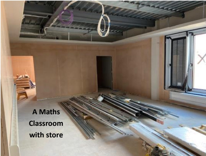
A Maths Classroom with store