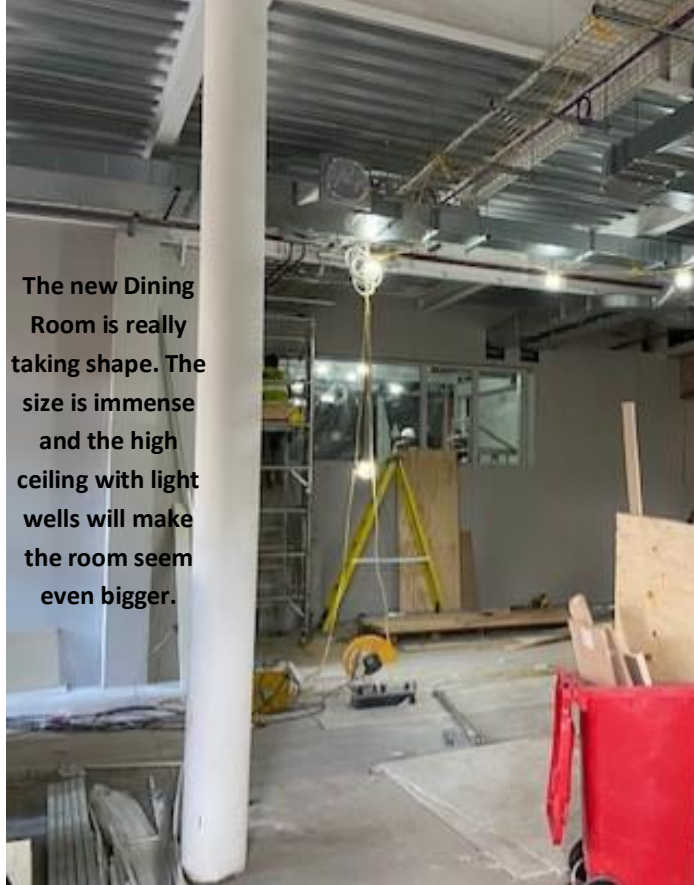
The new Dining Room is really taking shape. The size is immense and the high ceiling with light wells will make the room seem even bigger.