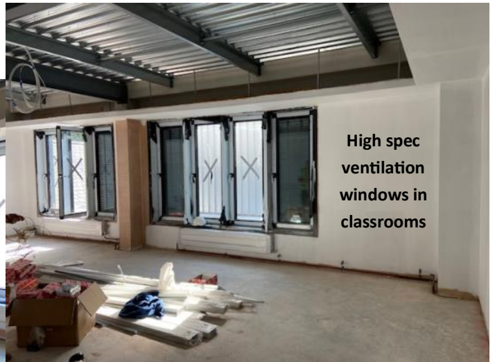
High spec ventilation windows in classrooms