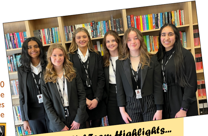
Head Girl Team Highlights...