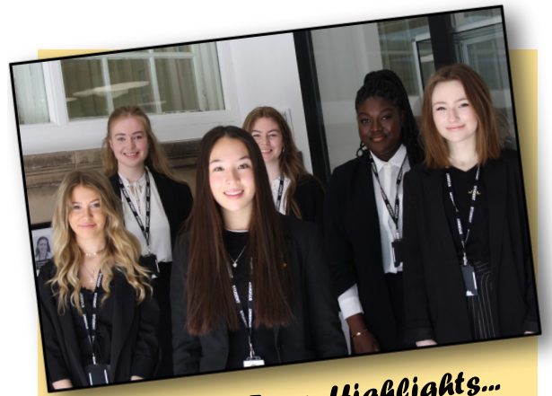
Head Girl Team Highlights...