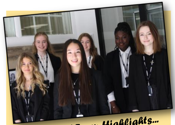
Head Girl Team Highlights...