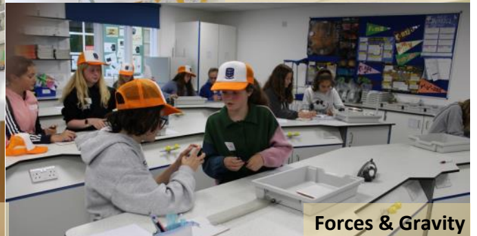
Forces & Gravity