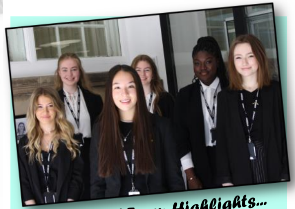
Head Girl Team Highlights...

As usual, our School Development Plan is written around four key strands. Beneath each are a series of actions, shared among colleagues at all career stages and governors. This year's priorities for our school (with a few key examples) are as follows: