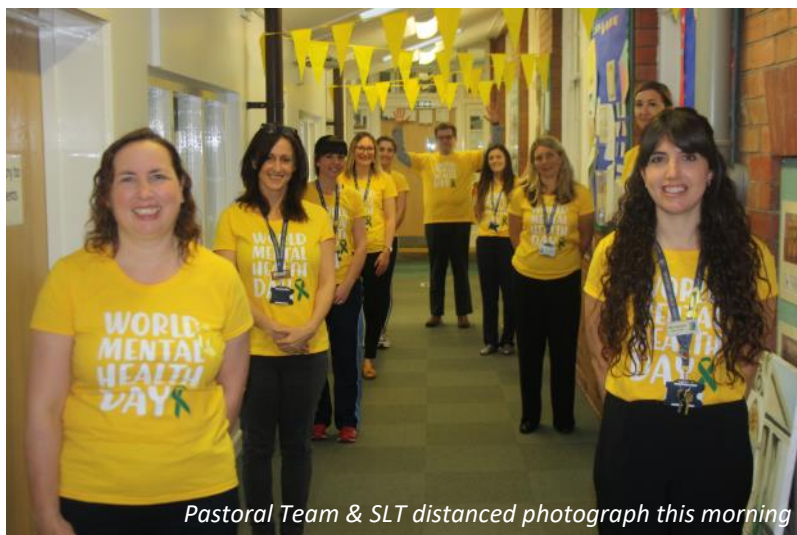
Pastoral Team & SLT distanced photograph this morning

Volume 4 - Issue 5 - Friday 9 October 2020