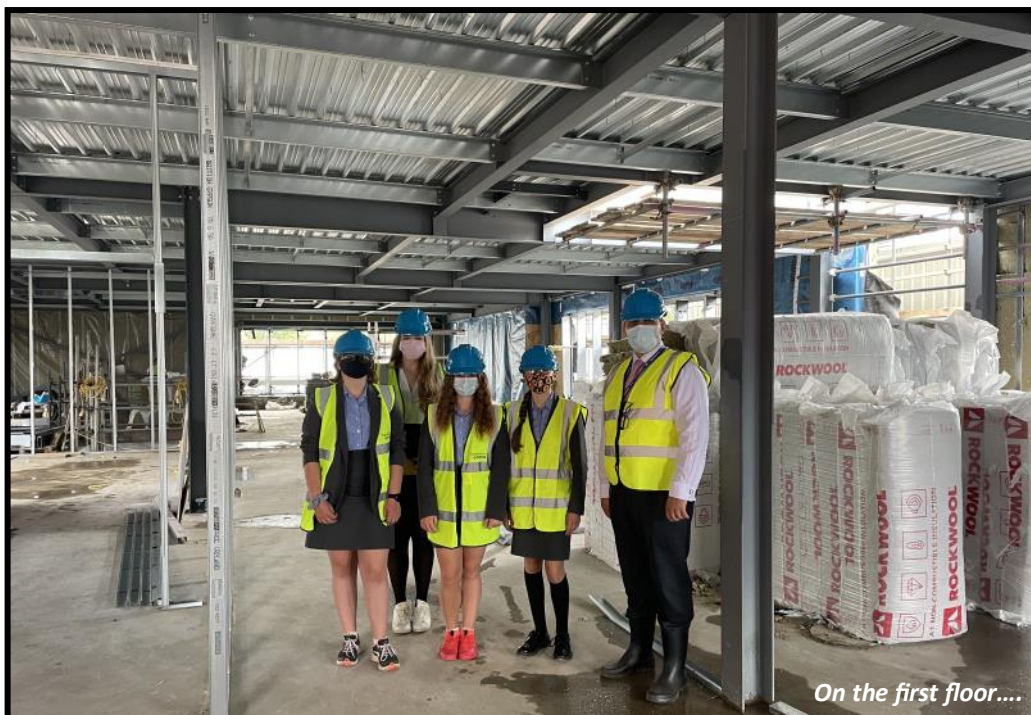
On the first floor....

Volume 4 - Issue 39 - Friday 16 July 2021