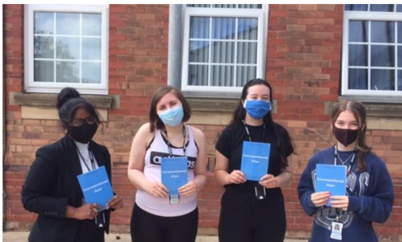
Four of the student authors with their copies of the book they helped to write