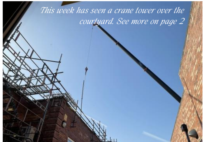
This week has seen a crane tower over the courtyard. See more on page 2

I understand there will be announcements over Easter concerning testing in April/May and information for the return to school on Monday 19 April. I will of course keep you updated.