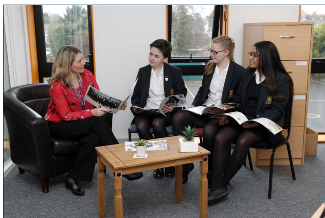
Advice & guidance is offered when choosing subjects

Why NGHS6? Life here is a pleasure. I have received never-ending support and encouragement from my peers and teachers. My involvement in MedSoc has also prepared me well for my future career.