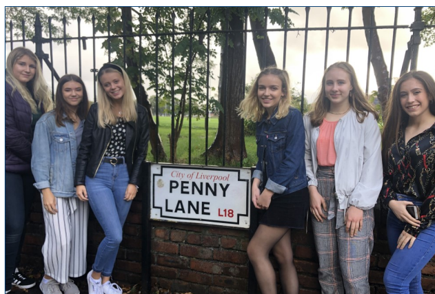
Our Liverpool residential helps you to settle in quickly