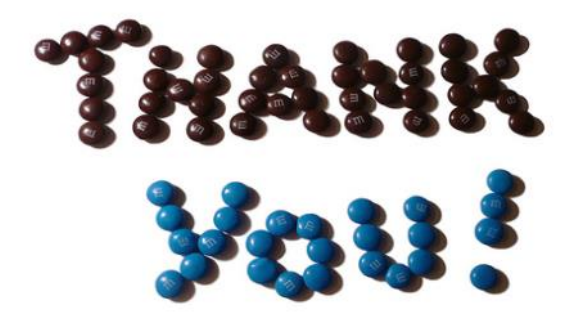
Congratulations to our Thank You Friday nominees this last fortnight.