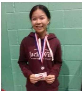
Plate - 1st Idsall, 2nd NGHS, 3rd Burton Borough

Trophy - 1st NGHS, 2nd Burton Borough, 3rd William Brookes (Guest)