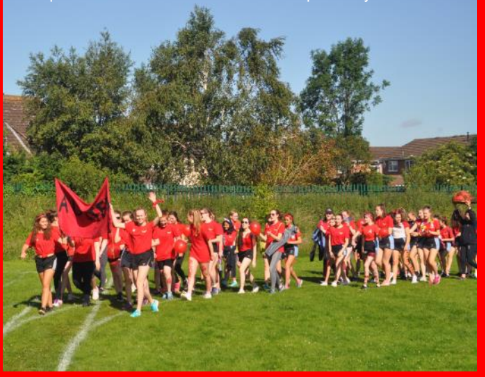
Just part of the Austen House Parade on Sports Day last summer