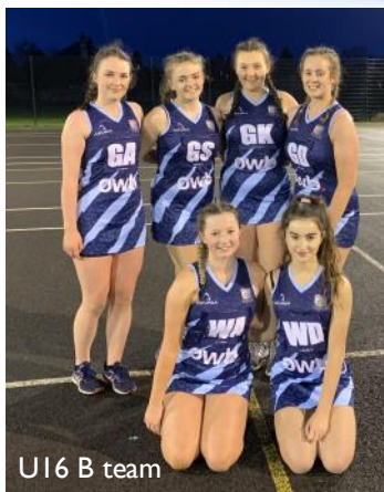
U16 B team