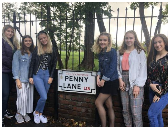
Year 12 weekend in Liverpool is a real hit in October

A unique opportunity this sixth form offers us is the chance to go on an NHS placement which involves volunteering for 3-4 hours a week for sixth months as you work on wards as part of the team. It allows those