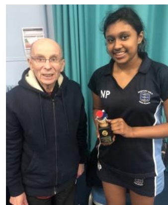
Table Tennis Champ

Thursday 27th Feb U15 Handball Year 10 Netball