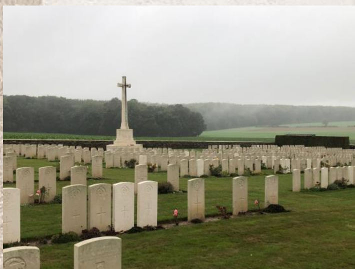
One of the many British cemeteries visited over the weekend (as well as French, German and Canadian memorials).

Day two was jam-packed with places to visit and things to do. We crossed the border into Belgium and headed to the historic town of Ypres. Here, we visited an English church full of memorials and remembrances. Our guide then led us to the In Flanders Field Museum at the beautiful Cloth Museum, where we roamed freely, looking at the various exhibits and videos. Following this, we went to a chocolate shop where we all treated ourselves to Belgium Chocolate and some of us even attempted to speak some Flemish! That afternoon, we visited a number of cemeteries in the Ypres Salient [including British, French and German], where Robert told us interesting