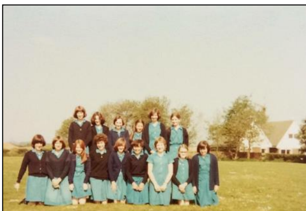
Back in the day.... Pictures from 1980s at NGHS