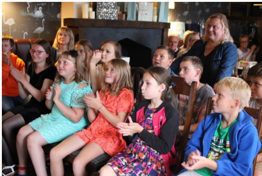
The group of ten students who visited Newport & Staffs in 2018

Charity No 1059832 www.chernobyl-children.org.uk