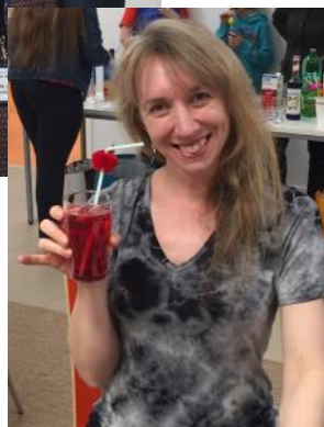
The Mr To-Tolley Tropical & Mrs Tutti Frujii mocktails were a real hit!

Many thanks to all who came to the PTA's Chillax and Pamper Evening last night.