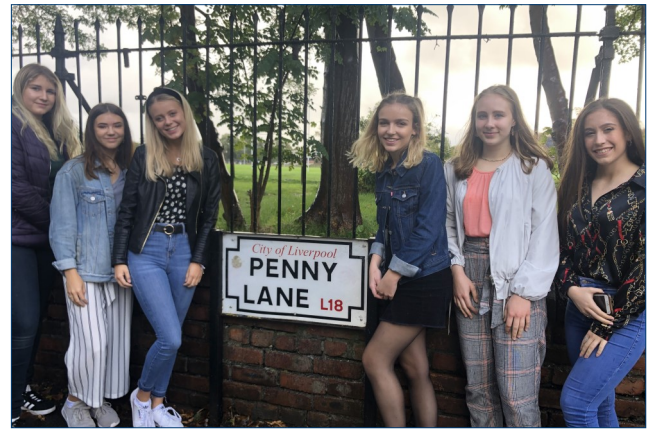
Our Liverpool residential helps you to settle in quickly