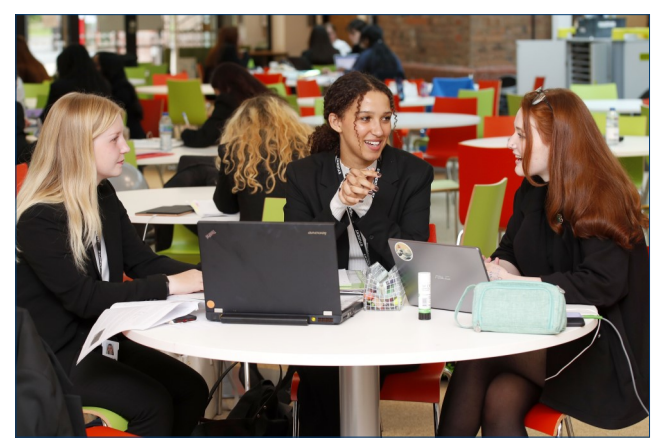
Our Atrium is a great place to chat and work together