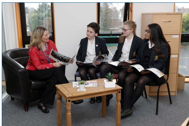
Advice & guidance is offered when choosing subjects

Why NGHS6? My role in YE included team leadership and public interaction. It has been a fun and challenging role and my team were commended with four awards for our idea of Planetbox; a sustainable everyday item gift box.