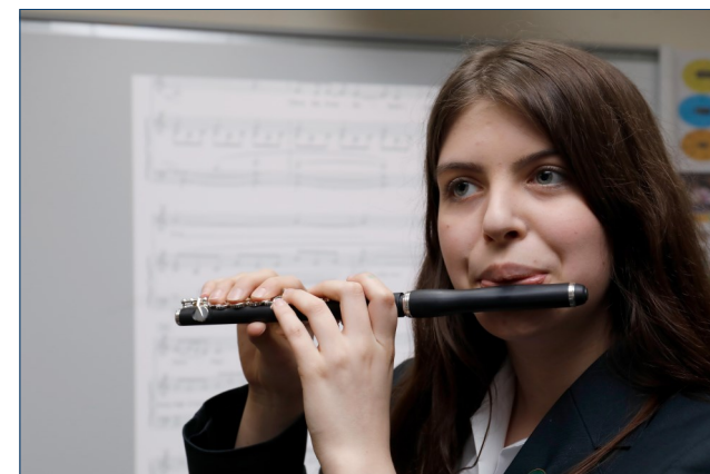
Why not join our range of musical ensembles?