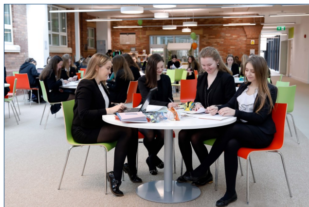
The Atrium provides work space for all students