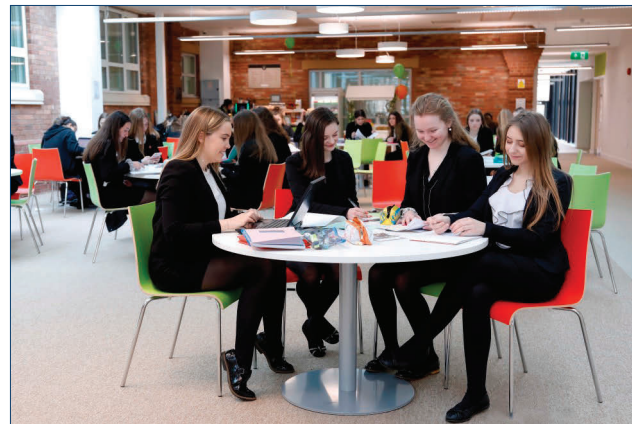
The Atrium provides work space for all students