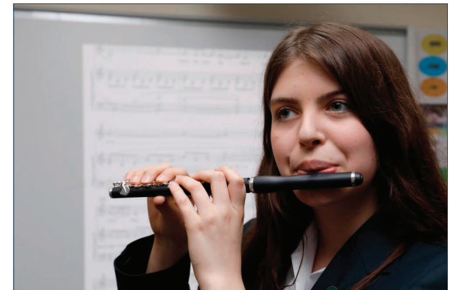
Why not join our range of musical ensembles?